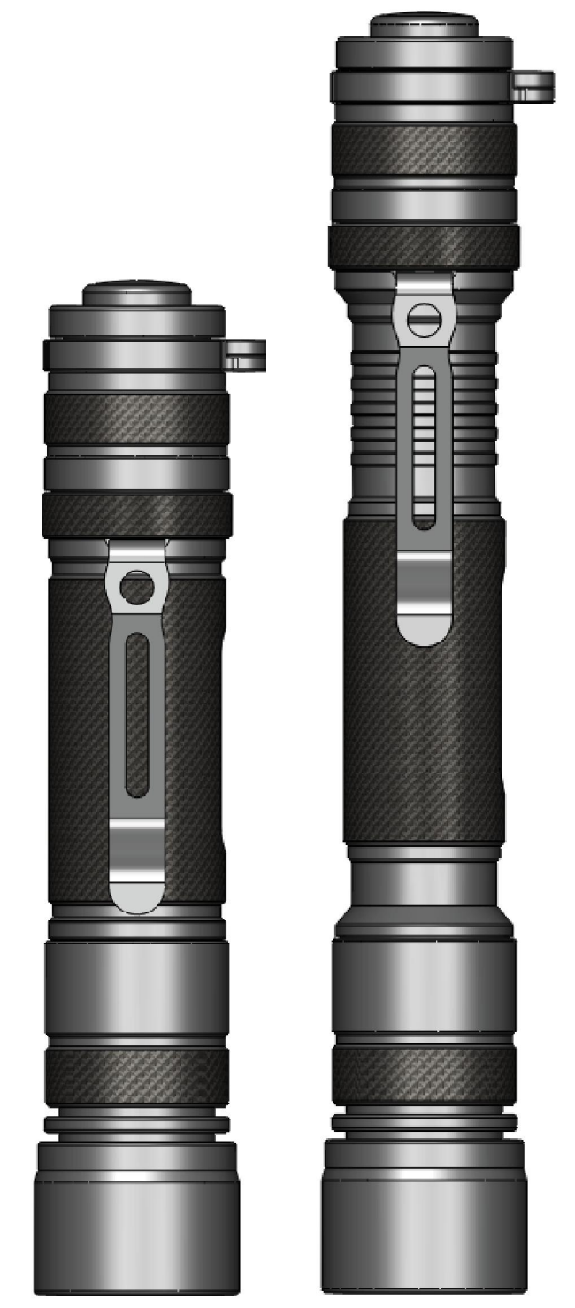
EAGTAC High Performance Tactical Flashlight http://www.eagtac.com

EAGTAC P200LC2 and P200A2 packs big lumen output and long beam distance in a compact, tough and grippy body. It offers versatile user interface, highly efficient current regulated circuit, and rich accessories like no other. Be crazy lumen and long distance beam with you in the dark.